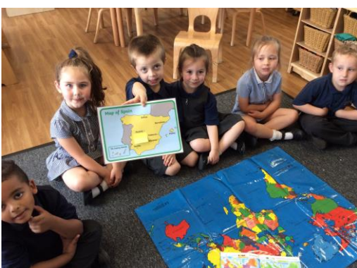
'Never settle for less than your best'

Jesus said, 'I am the light of the world. Whoever follows Me will not walk in darkness, but will have the light of life.' John 8:12